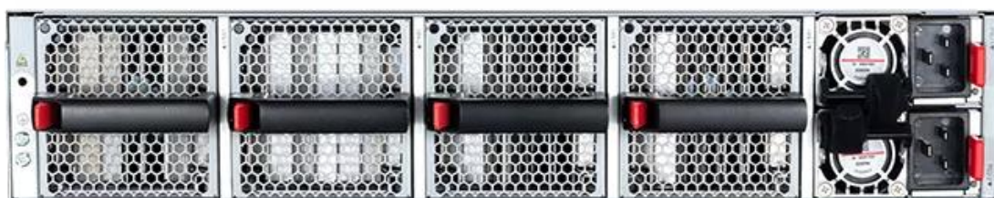
N9520-640C Rear View