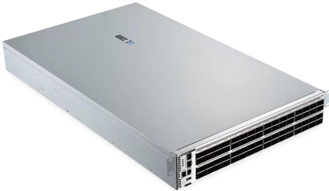
N9520-640C Front Top View