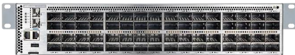
N9520-640C Front View